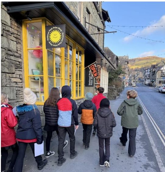
Year 6 delivered Christmas cards to local businesses, including those who kindly supported our Christmas Raffle.