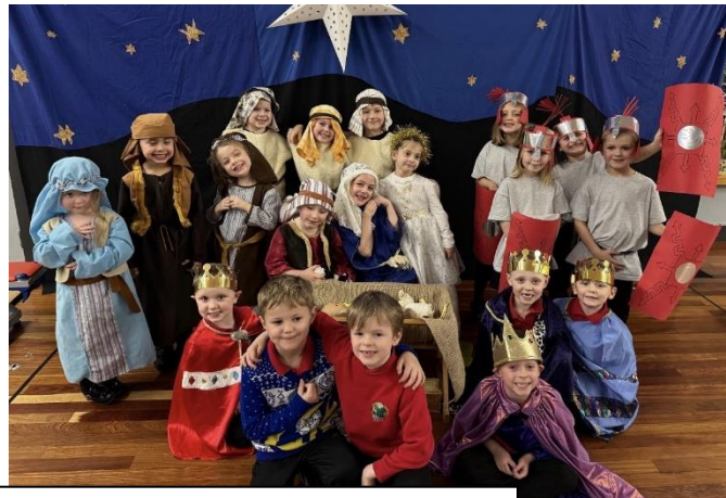
Loughrigg Class performed the nativity for their friends and families.