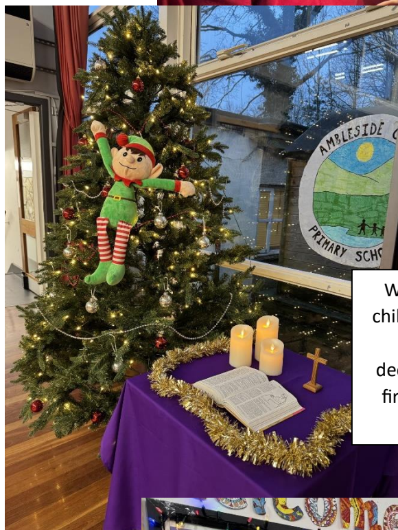
We surprised the children with lots of Christmas decorations for the first school day of December.