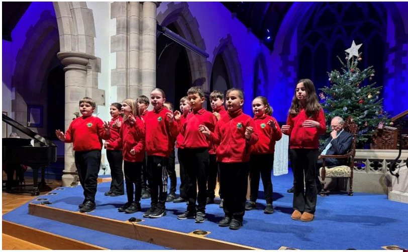
We joined the local community at the annual carols by candlelight service.