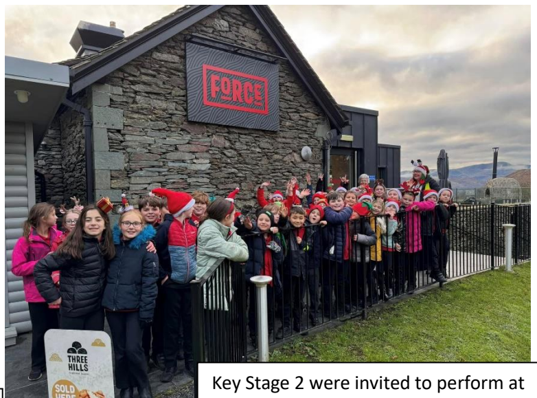
Key Stage 2 were invited to perform at the Force Café, Ambleside, and were treated to hot chocolate afterwards.