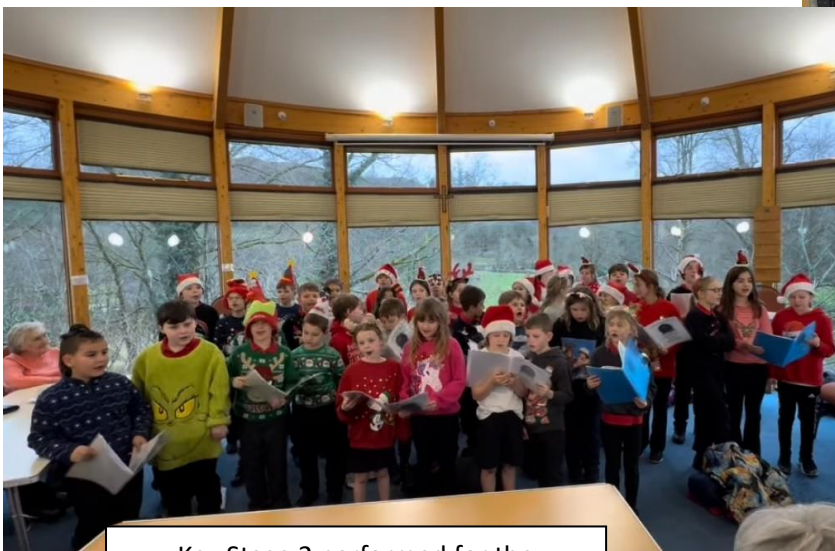
Key Stage 2 performed for the Evergreens at the Parish Centre.