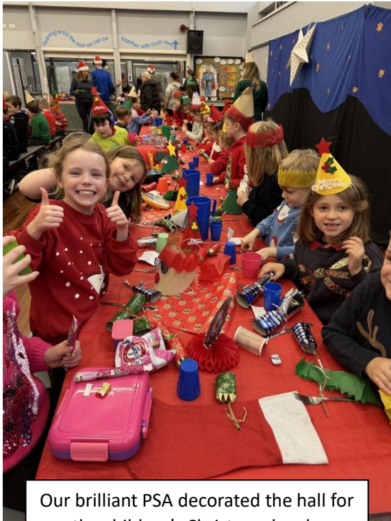
Our brilliant PSA decorated the hall for the children's Christmas lunch.