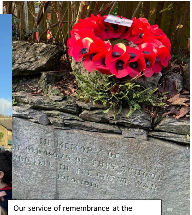
Our service of remembrance at the school memorial – 11 th November, 2024.