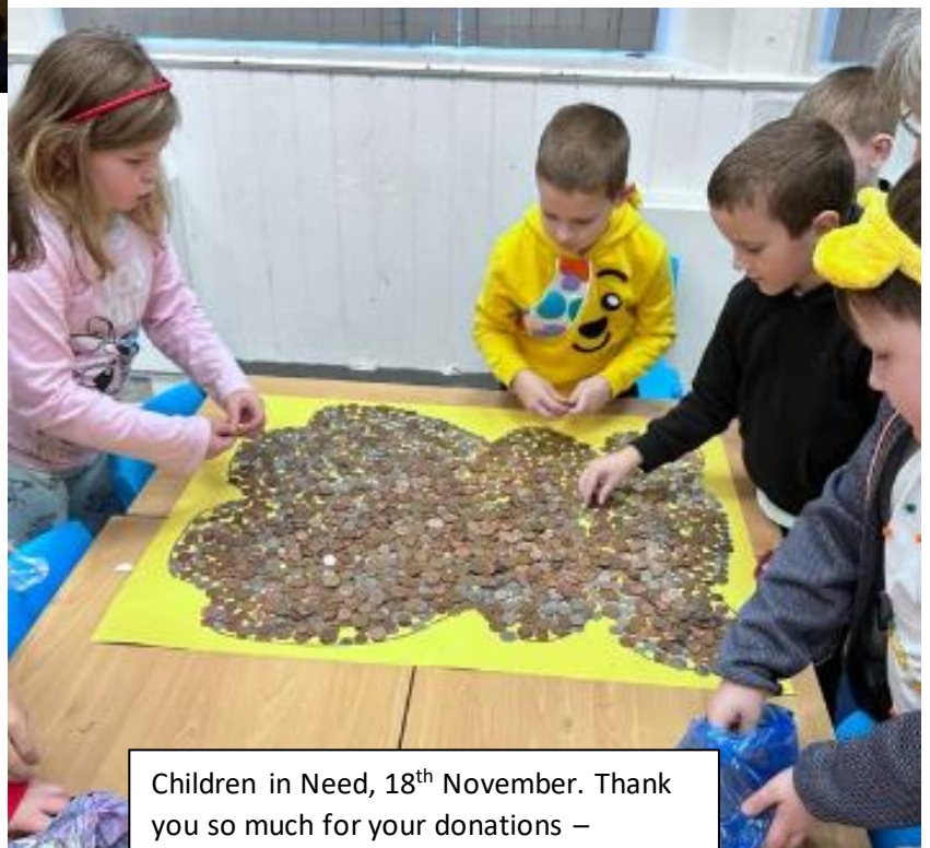
Children in Need, 18 th November. Thank you so much for your donations – together, we raised £162!

This year, we are raising funds to develop our playground at the back of the school. Our OPAL playtimes have made a huge difference to the range of activities on offer for the children but we have plans to improve things even further. We want to develop the climbing area to add another climbing frame next to our existing one, add a new sand pit (so that more children can access the sand during breaktimes), replace the water area on the playground and replace some of the play surface to make it Ambleside weather proof!