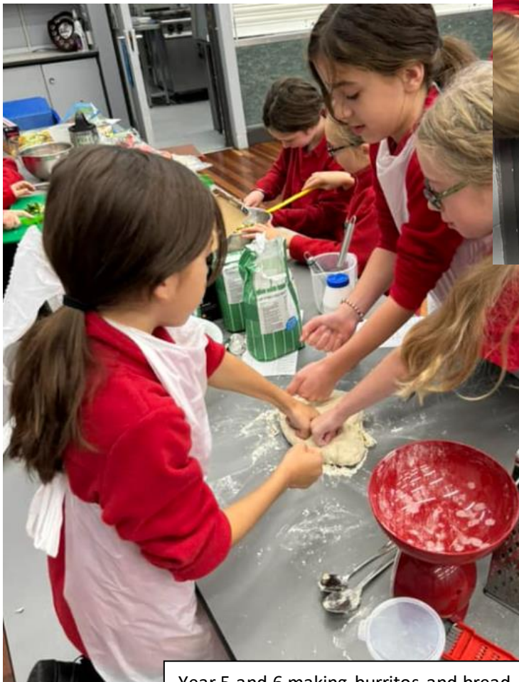
Year 5 and 6 making burritos and bread in their latest DT project.